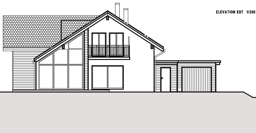
ELEVATION EST 1/200