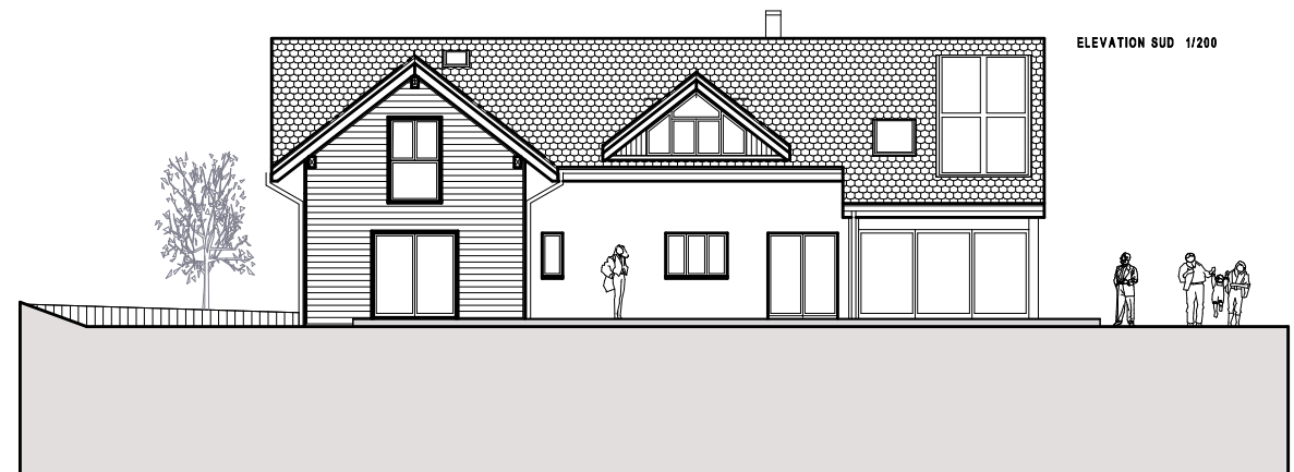
ELEVATION SUD 1/200